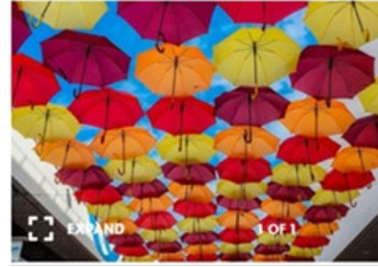
Elmhurst Umbrella Sky Installation Through August 31st – send me pictures!!!!