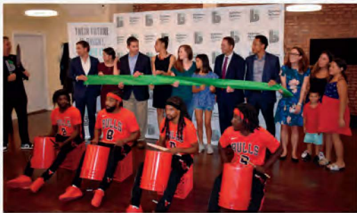
West Side 2022

As part of our continued drive to reach 5,000 children and ultimately double the number of youth and families we serve, BBBSChi opened its second regional office this July in the Austin neighborhood on the West Side of Chicago. Creating this crucial presence in the community was made possible thanks to the support of all of the Drive for 5 donors and foundational investments from BMO, Caerus Foundation, Chicago Bulls Charities, GTCR, and United Scrap Metal. Our Austin neighborhood office, in partnership with the Westside Health Authority, follows the 2019 opening of our Englewood office as part of BBBSChi's strategic plan to ramp up investments in communities where the majority of our waitlisted youth reside.