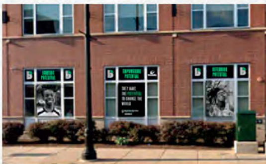
South Side 2019